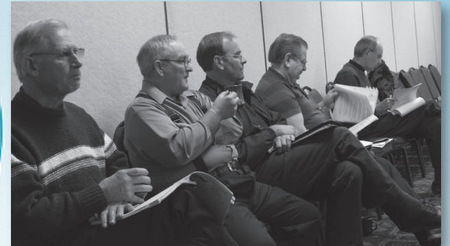
Pictured Above: Morton County representatives listened intently to the future plans of the Southwest Pipeline Project while attending the November Southwest Water Authority Board of Directors' Meeting in Mandan.