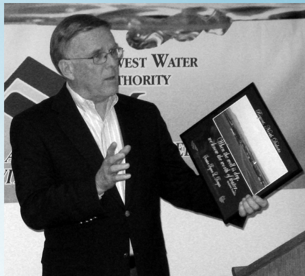
Senator Dorgan holds a photograph of his hometown, Regent, ND, presented to him on behalf of SWA. The photograph's caption read, "When the well is dry, we know the worth of water." – Benjamin Franklin.

Southwest Water Authority does not discriminate on the basis of race, color, national origin, sex, religion, age, marital status or disability in employment or the provision of services.