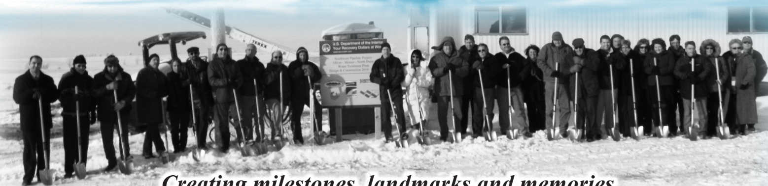
Creating milestones, landmarks and memories Oliver, Mercer, North Dunn Water Treatment Plant Groundbreaking Ceremony November 23, 2010

Southwest Water Authority is not responsible for cash payments mailed or deposited in the drop boxes!