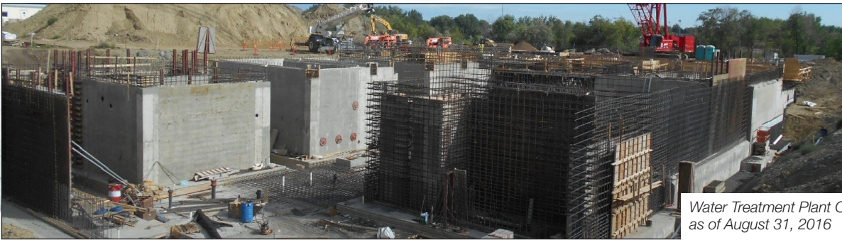
Water Treatment Plant Construction as of August 31, 2016