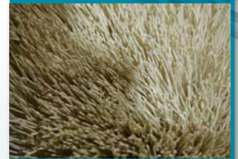
Ultra Filtration & Reverse Osmosis Treatment Filaments

It is the most advanced way to filter impurities from water by forcing water under pressure through tiny spaghetti-like filaments that remove virtually everything, both seen and unseen! This Water Treatment Plant is cutting-edge technology in the treatment process. SWA continues to ensure quality water for everyone served by the Southwest Pipeline Project.