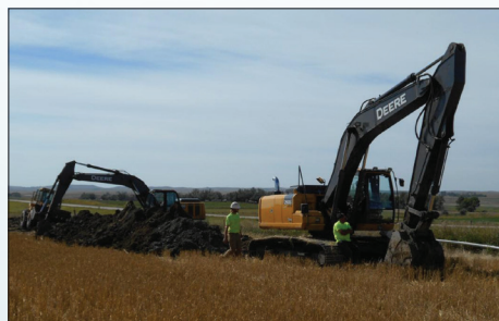
Rural Pipeline Installation

If you are a landowner in Dunn County and are interested in receiving quality water, NOW is the time to sign up. Signing up before bid date gives you the opportunity to do so for a lower price.