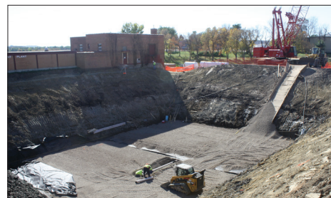
Finished Water Pump Station

Some of the items to be funded are the pump station for the second intake, the supplementary water treatment plant in Dickinson, upgrading current pump stations and building