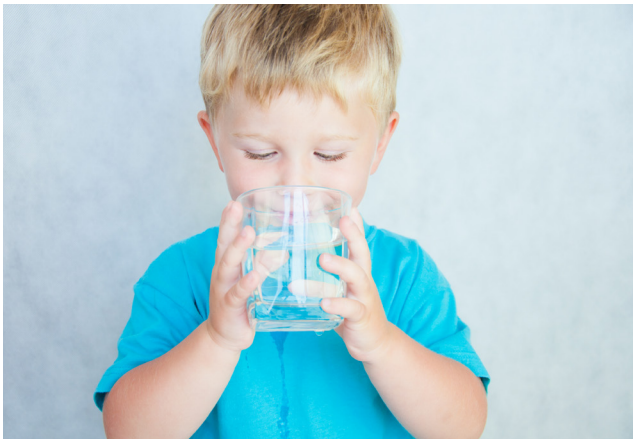
SWA's drinking water is monitored 365 days a year, 24/7 for its quality.

You are welcome to attend any of our Board meetings, which are generally held on the first Monday of each month. If you are interested in attending or would like to request agenda time, please contact us at the number listed above for information on time and location. If you are aware of non-English speaking individuals who need assistance with the appropriate language translation, please contact us at the number listed above. In order to allow individuals who consume our drinking water, but who do not receive water bills, to learn about our water system, we would appreciate it if our large volume water customers would post copies of this report in conspicuous locations or distribute them to tenants, residents, patients, students, and/or employees.