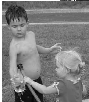
Smith kids, Beach