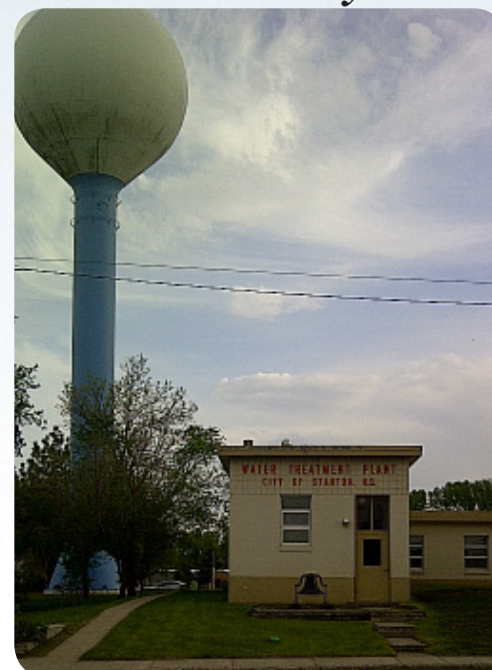
The citizens of Stanton began receiving SWPP water on May 16, 2012.

To their delight, they learned the city had converted to SWPP water earlier that day. They were given a tour of the now quiet WTP in Stanton.