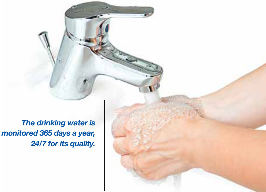
The drinking water is monitored 365 days a year, 24/7 for its quality.